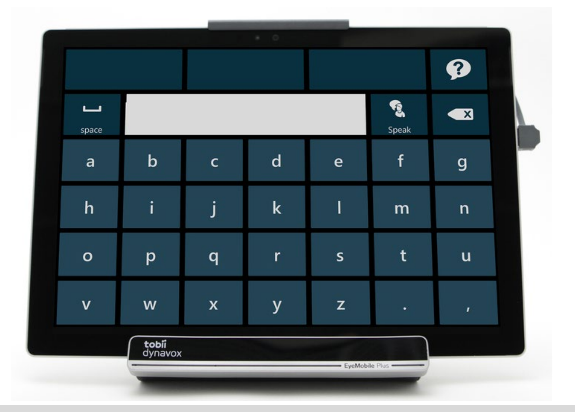
Tobii Dynavox Eyemobile plus with keyboard, designed by Tobii Dynavox