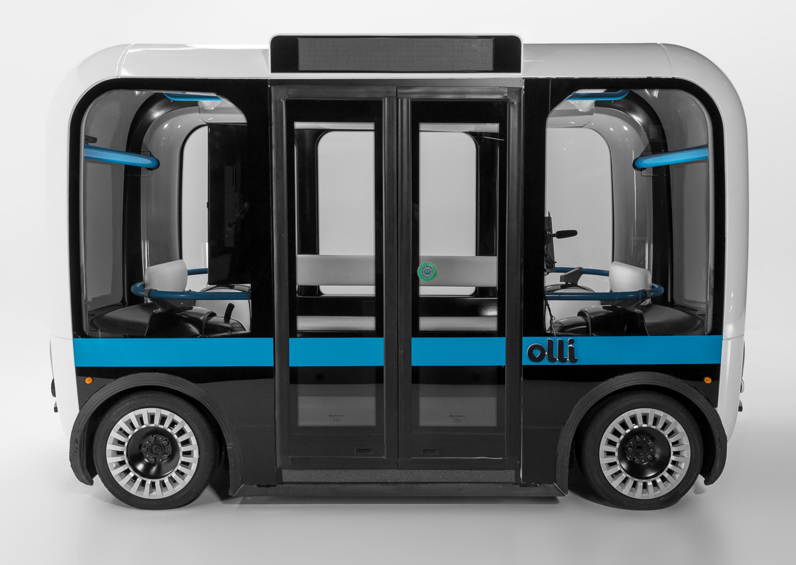
Accessible Olli Shuttle, designed by Local Motors