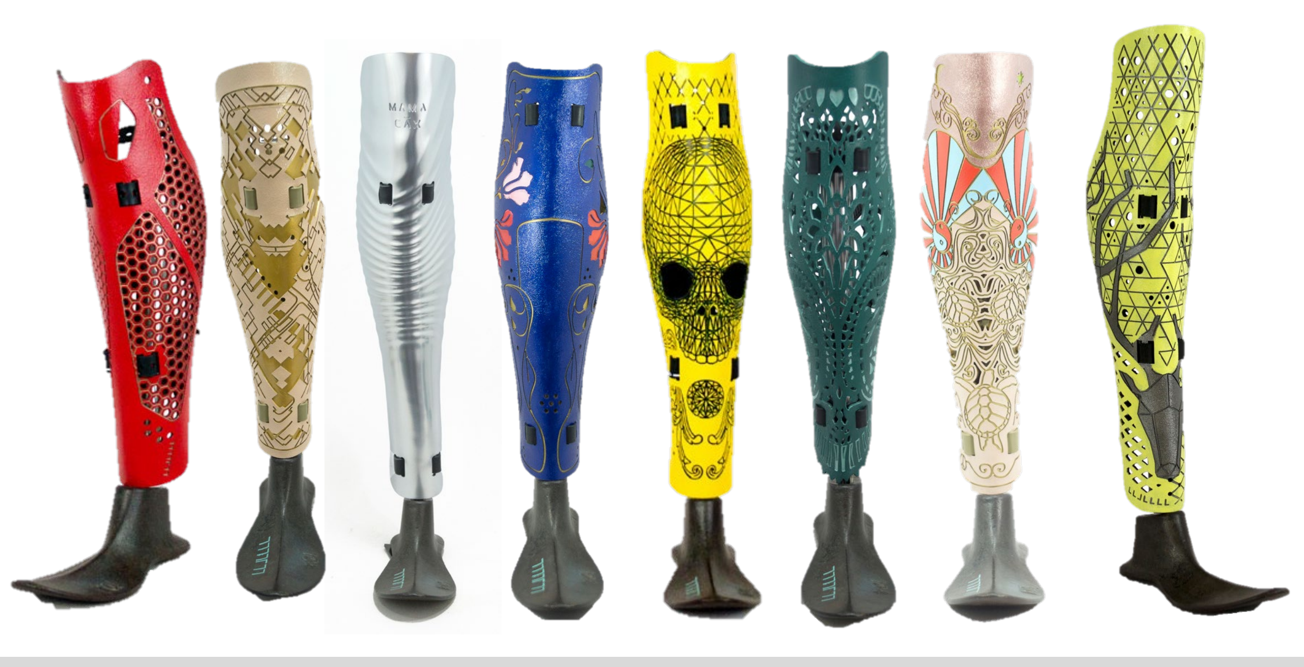
Prosthetic Leg Covers, designed by Alleles Design Studio