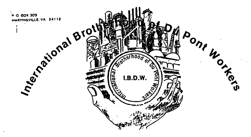
September 27, 1989

The Honorable David Pryor Chairman, Special Committee on Aging United States Senate Washington, D.C. 20510